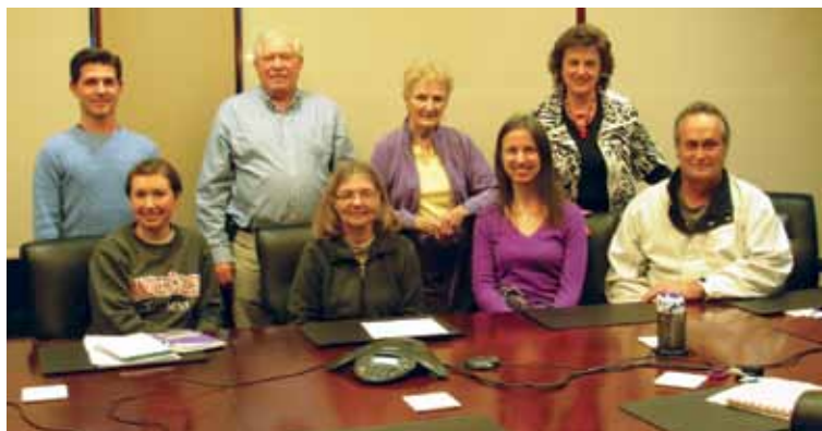
US Dance Troop Greater Louisville Chapter